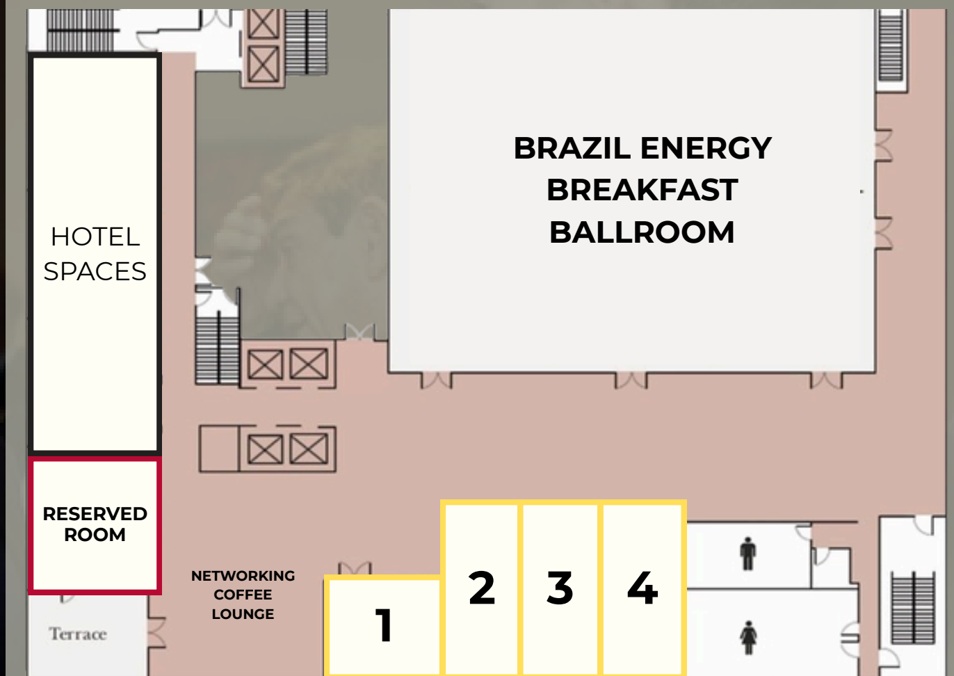
Picture of Room 4 - Sycamore.